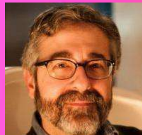
Warren Spector Studio Director, Otherside Entertainment