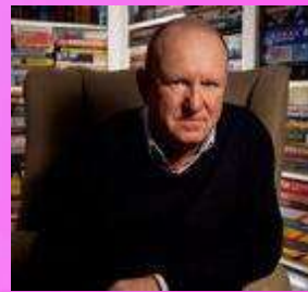
Ian Livingstone Co-founder Games Workshop