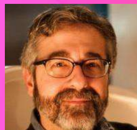
Warren Spector Studio Director, Otherside Entertainment